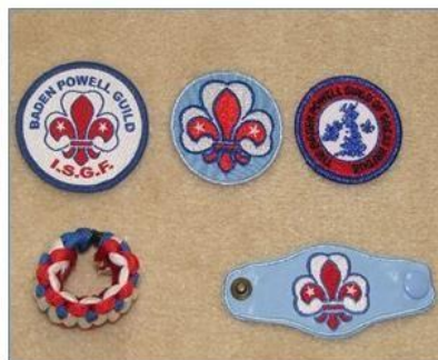
Fabric badges (left to right above)

Old stock of metal badges – price negotiable