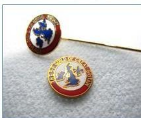
Long pin metal badge £3.20

Old stock of metal badges – price negotiable