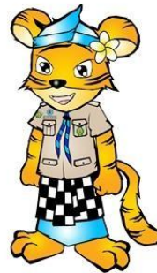
The Mascot 28th ISGF-AISG World Conference 2017