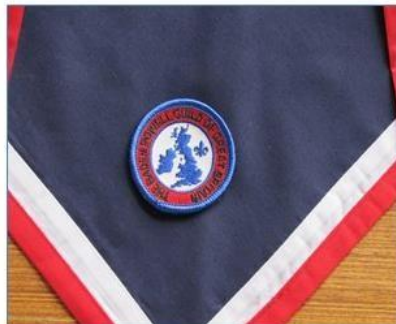
Guild Scarf / Necker (does not include any badges) £4.00